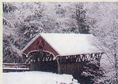
The Flume covered bridge in Franconia Notch State Park spans the Pemigewasset River.